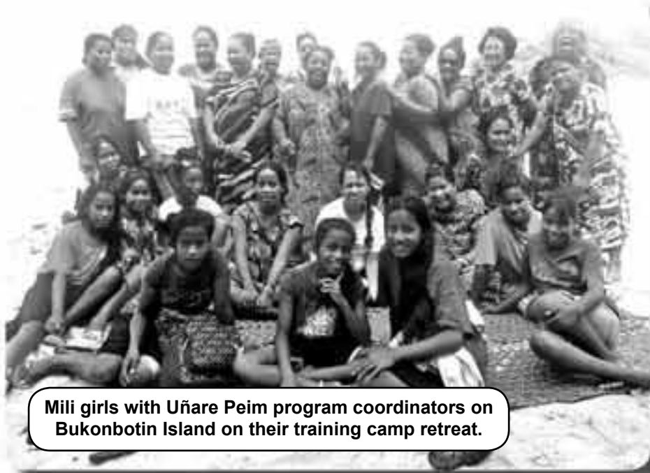
Mili girls with Uñare Peim program coordinators on Bukonbotin Island on their training camp retreat.